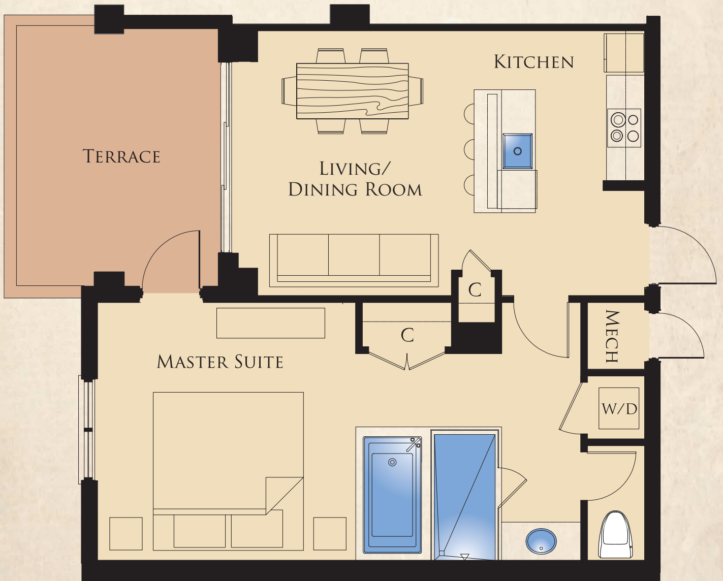
SABAL PALM FLOOR FOOTPRINT